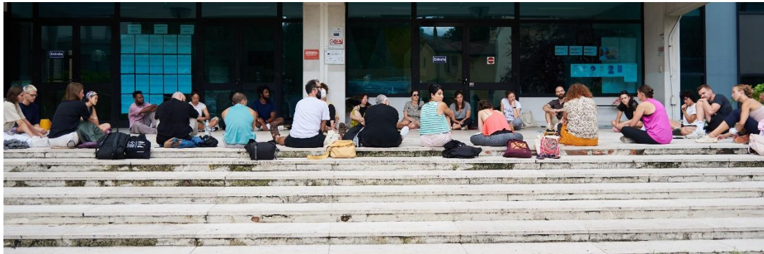
Carte Blanche Session

In the question and answer session that followed, it became clear how important it is to find the right language to articulate dance as a practice so that we can better advocate for and communicate about it.