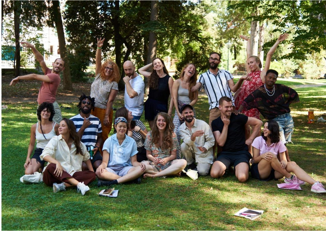
Carte Blanche Sessions' group participants