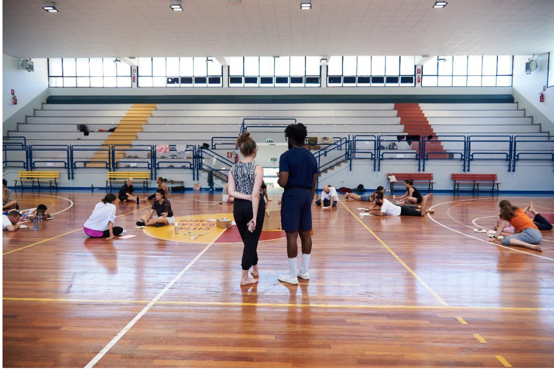
Carte Blanche Session

What do you need to be critical about, in order to make it stronger? What can you do about it in the long term? What can you do in the next few days?